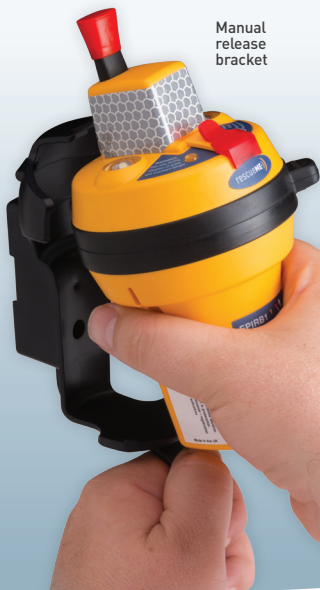
Manual release bracket

A simple protective tab over the operating keys prevents inadvertent activation, yet allows for easy operation when required. The rescueME EPIRB1 also features two high brightness strobes to maximise visibility in low light conditions.