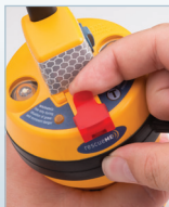
EPIRB keys with protective tab