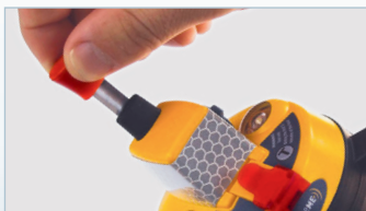
Easily deployed antenna

The retractable antenna provides maximum protection and a reduced outline for stowage. When required the antenna is easily deployed with a gentle pull.